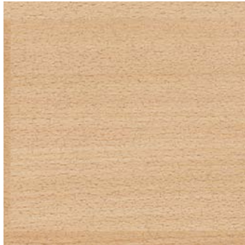
Warm Beech 3297