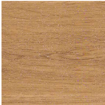
European Oak 3347