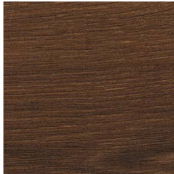
Aged Oak 3373