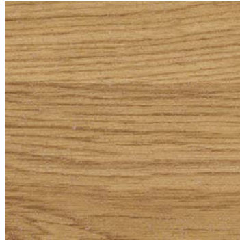
Rustic Oak 3337