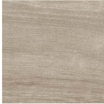
Sun Bleached Oak 3372