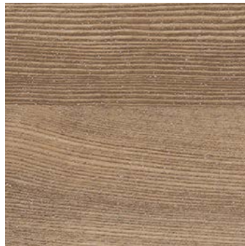
Tropical Pine 3376