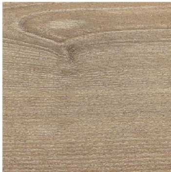
Roasted Limed Ash 3375