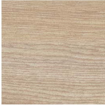
Oiled Oak 3374